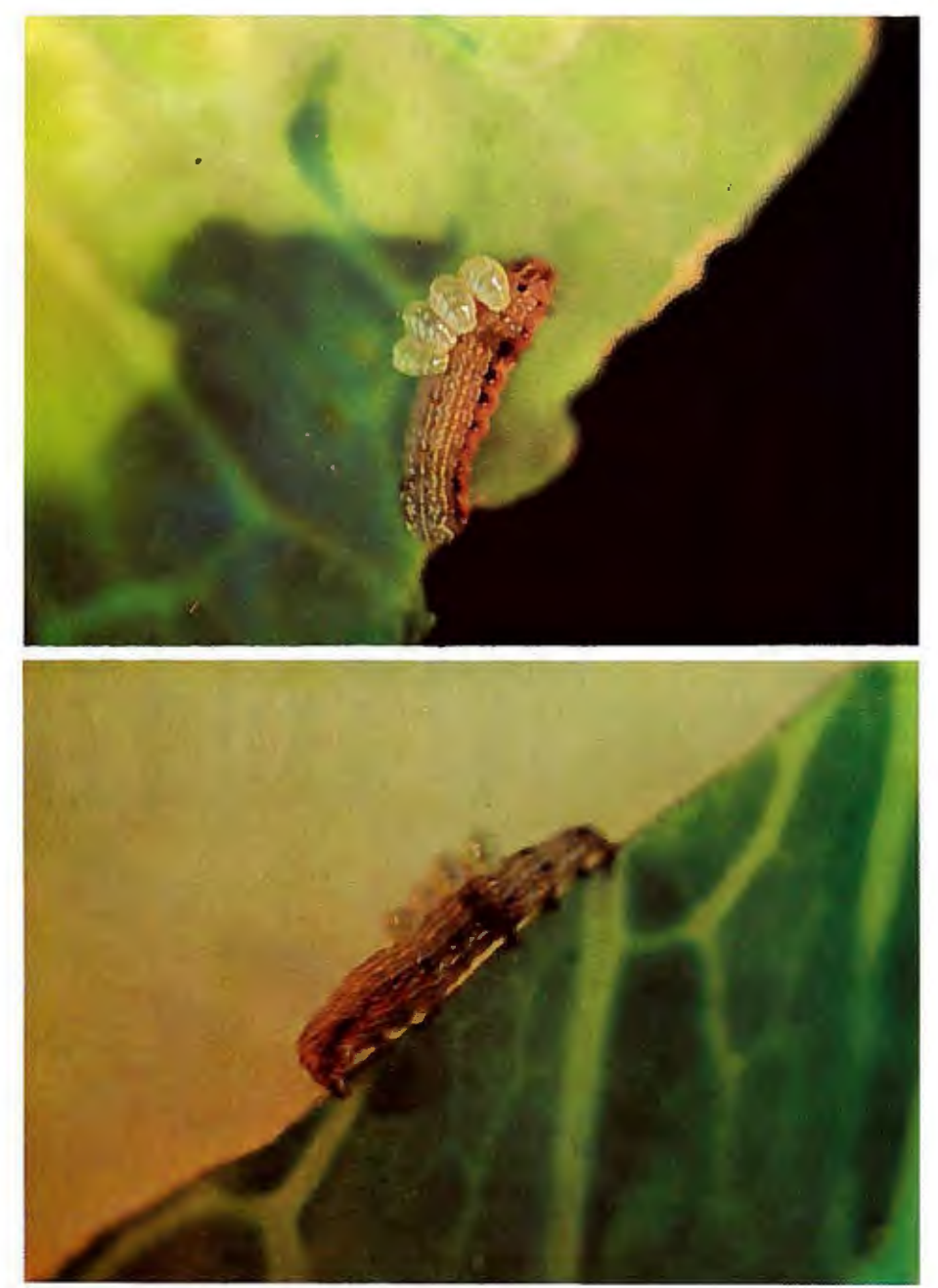
Spodoptera litura larva with ectoparasites (two views).