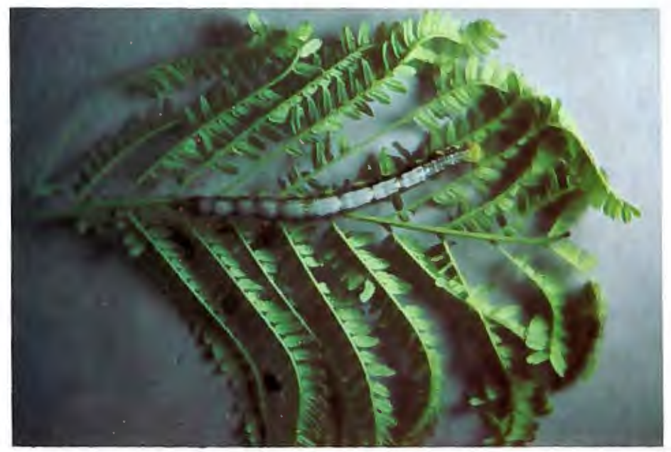
Poinciana looper, Pericyma cruegeri (Flame tree looper).