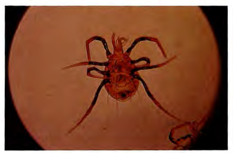
Predatious mite, Phytoseilus persimilus.