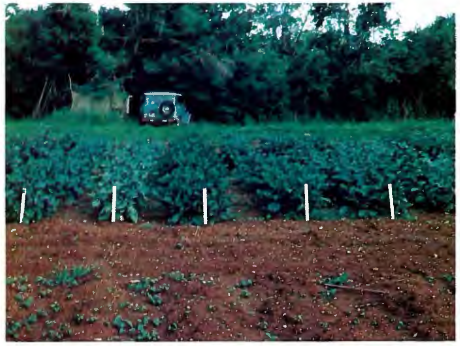
Eggplant experimental plot.

The cottony rot disease caused by a soil inhabiting fungus, Phytophthora paracitica caused most of the non-marketable fruit. A cottony mold grew abundantly in the diseased fruit especially during the wet season. The disease was more frequently noticed in fruit that had contact with the soil surface. Black Torpedo was least susceptible to fruit rot, with 8.39 percent of non-marketable fruit out of the total fruit production. The variety most susceptible to the disease was Ma Chi having 33% non-marketable fruit.