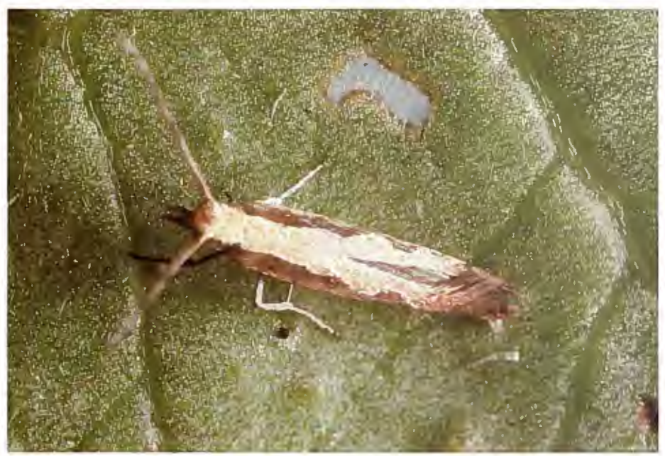
Diamondback moth, Plutella xylostella.