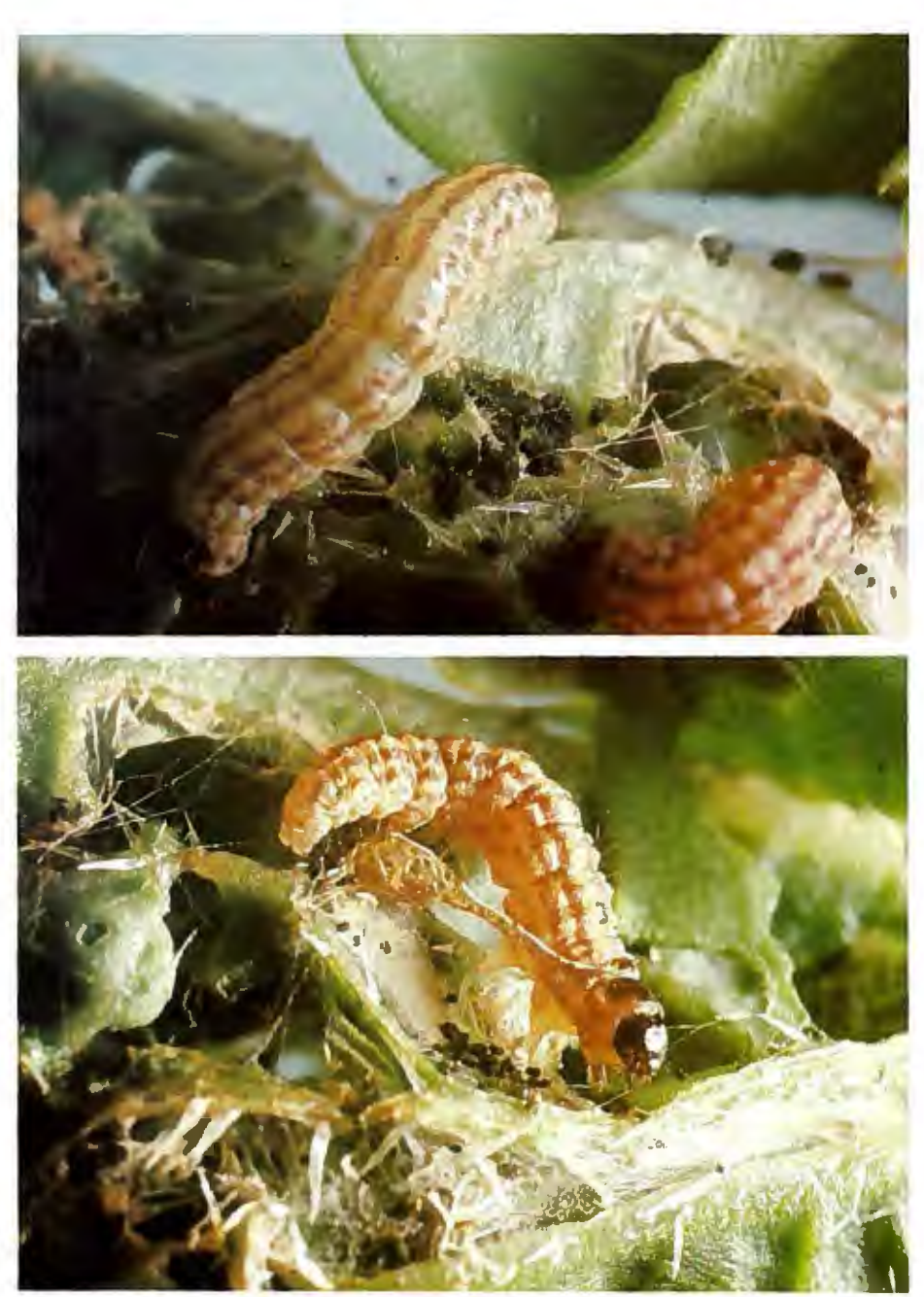
Cabbage borer, Hellula undalis (two views).