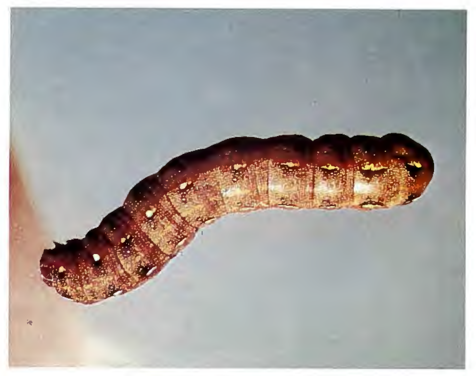
Cut worm, Spodoptera litura.

A field experiment is in progress to evaluate the resistance of commercial eggplant varieties to the broad mite. Out of the 9 different varieties of eggplants tested, local long green, Black Torpedo and Waimanalo long seem to be tolerant to P. latus .