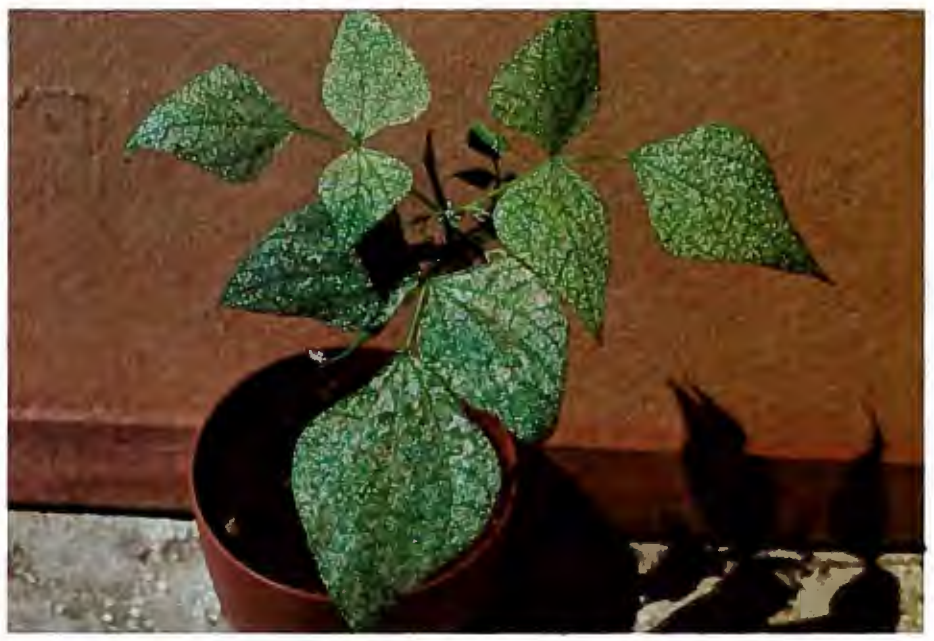
Bean plant affected by tumid mite, Tetranychus tumidus.