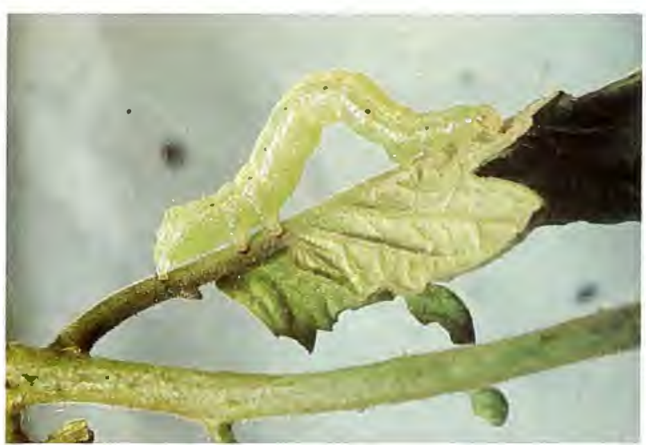
Garden looper, Chrysodiexis chalcites.