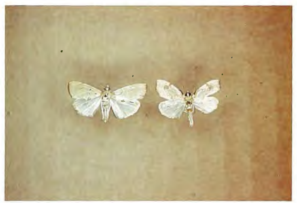
Cabbage webworm, Crocidolomia binotalis.