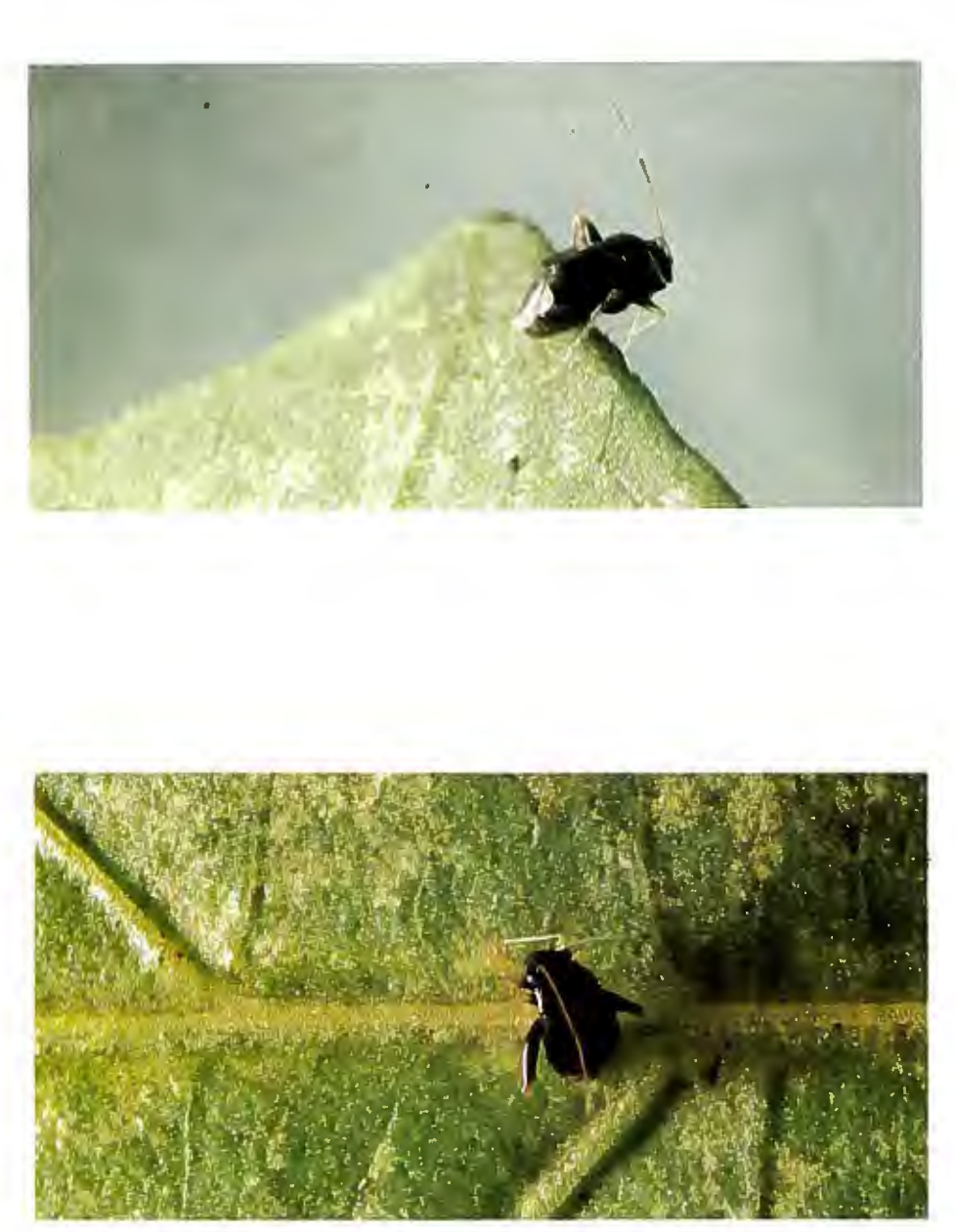
Flea hopper, Halticus tibialis (two views).