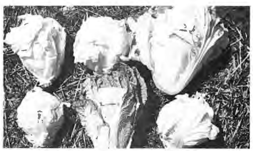
Different varieties of Chinese cabbage.

Chinese cabbage was harvested when heads were fully developed on heading varieties. Non heading varieties were harvested when plants were at the full size.