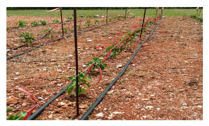
Fig. 2. Bell pepper varieties grown in Guam Cobbly Clay Loam in Yigo, Guam.

A variety trial was conducted at the Western Pacific Tropic Research Center, Yigo Agricultural Experiment Station, College of Natural and Applied Sciences, University of Guam (Fig. 2). On March 24, 2016, five varieties of bell pepper were transplanted in Guam Cobbly Clay Loam soil, a commonly cultivated soil in northern Guam, after growing in plant trays for 24 days.