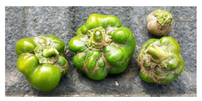
Fig 7. Heavy mite infestation on immature fruit.