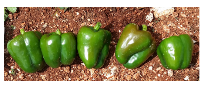
Fig 5. Intruder F1 harvest at mature green stage.