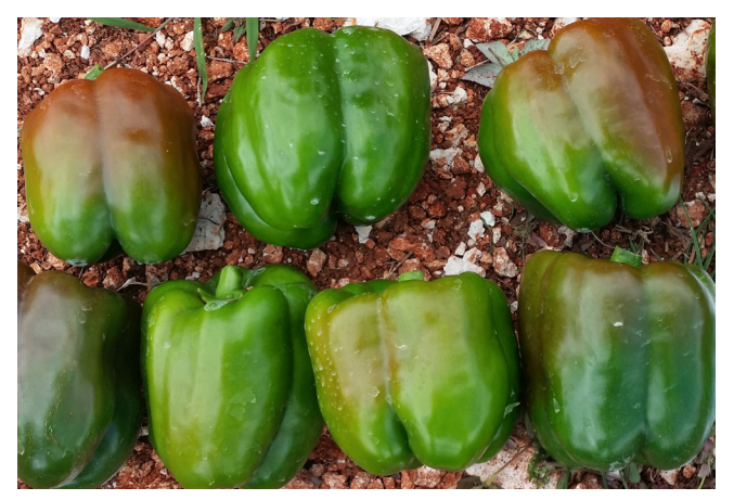
Fig 4. King Arthur F1 harvest at mature green stage.

All varieties produced marketable quality green fruit, but as indicated earlier, most fully maturing fruits were infected with anthracnose fruit rot (Fig. 4, Fig. 5, and Fig. 6). Gourmet F1, in particular, was singled out to await full maturity because of its attractive orange color when fully ripened. In local stores, orange and yellow bell peppers are sold at a range of $4.99-$6.99/lb versus mature green and fully ripened red bell peppers which are commonly sold at a range of $3.99-$4.99/lb. Sun scalding, fruit damage from extreme exposure to sun rays, occurred on a few fruits, particularly those not protected from canopy/leaf cover. Heavy thrip and mite infestations were apparent in the first week June. These infestations inhibited plant productivity resulting in very poor growth and development of immature fruits (Fig. 7). Fig. 8 are bar graphs depicting results from harvest data from the variety trial.