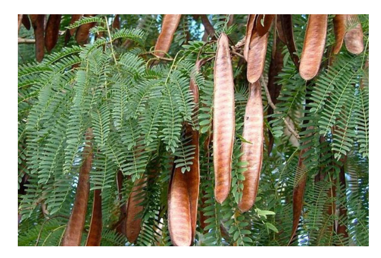
Figure 5. Leucaena leucocephala, tangantangan, is a naturalized tree to Guam used for nitrogen fixation.