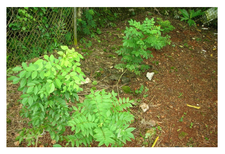
Figure 4. Row of Gliricida sepium used for hedgerows.

nitrogen fixation. This process allows the plant to receive the nitrogen needed for plant growth. It is important to know that for this process to be effective, the proper species of nitrogen-fixing trees need to be selected to match the strain of Rhizobia .