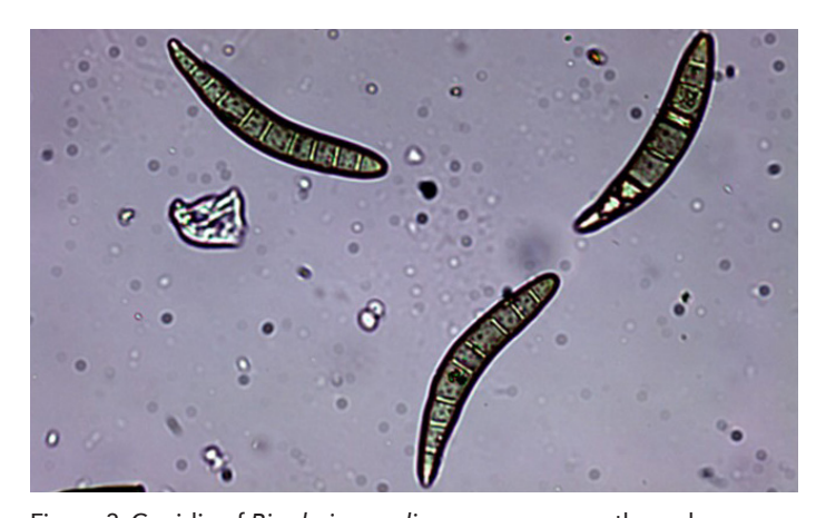
Figure 3. Conidia of Bipolaris maydis on corn, as seen through a compound microscope