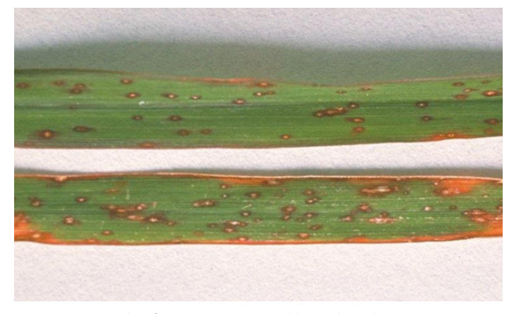
Figure 6. Example of "eye spots" caused by Helminthosporium species on grasses: Curvularia ischaemi on batiki blue grass