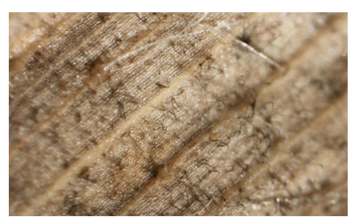
Figure 5. Black "hairs" are a sign of southern corn leaf blight caused by B. maydis