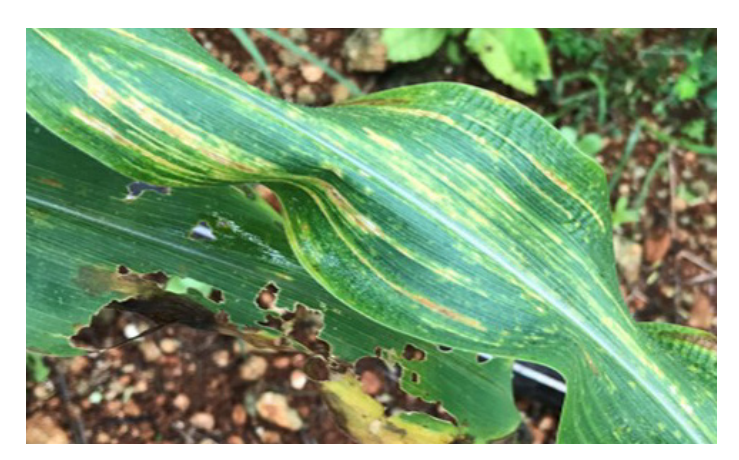
Figure 4. Southern leaf blight on corn, caused by Bipolaris maydis