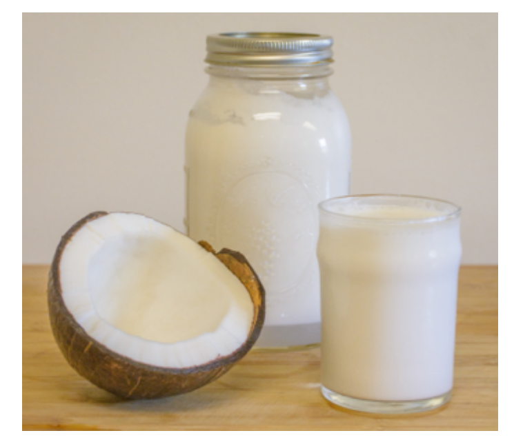
Figure 6. Coconut kefir made of coconut milk