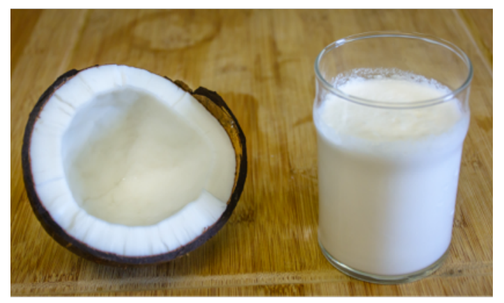
Figure 1. Homemade coconut kefir.

The Turkish word " Keyif " means good feeling, health, and well-being. In Eastern Europe, kefir is traditionally consumed for health benefits and longevity.