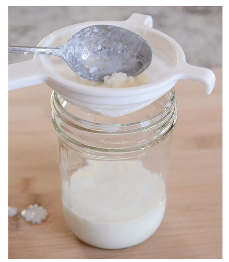
Figure 5. Straining grains from kefir.

After removing the kefir grains, the kefir can also be stored at 20-28 °C (70-83 °F) for 6-12 hours. This process is called the second fermentation, which can enhance the taste and flavor of kefir and increase the number of probiotics. To stop the second fermentation, place the kefir in the refrigerator at 4°C (40 °F). The second fermentation is optional and completely dependent on one's preference for taste.