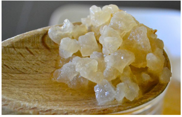
Figure 2.1. Activated water kefir grains.

Water kefir grains have a translucent and jelly-like appearance, normally containing fewer strains of bacteria and yeast than those of milk kefir grains. In addition to water kefir, the grains can be used to make other non-dairy kefir, such as fruit juice kefir. Kefir culture is usually in form of dry powders and convenient to use for kefir without activation. However, the number and the profile of probiotics in kefir culture may not be the same as in the kefir grains.