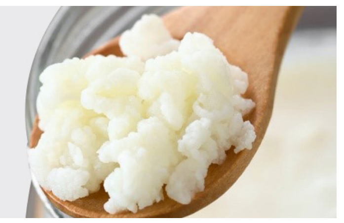
Figure 2. Activated milk kefir grains.

Milk kefir grains, water kefir grains, and kefir culture are three available cultures to make kefir products. Milk kefir grains are white or yellow semi-hard granules, like pieces of coral or small clumps of cauliflower florets with diameter from 3 to 20 mm. Milk kefir grains are obtained from the fermentation of milk in a goat-hide bag. Exopolysaccharide, protein, fat, and cellular debris form a matrix of kefir grains for probiotic cultures. The probiotic cultures are unevenly distributed on the surface and in the interior of the kefir grains. Milk kefir grains can grow during fermentation and be reused for making kefir.