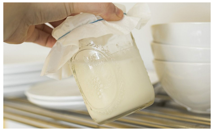
Figure 4. Checking milk during activation.

If the texture of milk becomes gel-like (thick) within 24 hours, separate the grains from the milk by a strainer and discard the first batch of kefir. Place grains in 1.5 cups of fresh milk and incubate at the same temperature for 8-24 hours; strain out the grains after the milk thickened. Repeat this activation process with increasing the amount of milk by 0.5 cup each time until the kefir grains are able to ferment up to 4 cups of milk. During activation of kefir grains, if milk does not thicken after 24 hours, strain out and reactivate the grains with the same amount of fresh milk until the milk is thickened. During inactivation, kefir made after the first batch can be saved and consumed if the smell and taste is pleasant. Fully activated grains, which can consistently thicken milk within 24 hours, will be used for fermenting coconut milk.