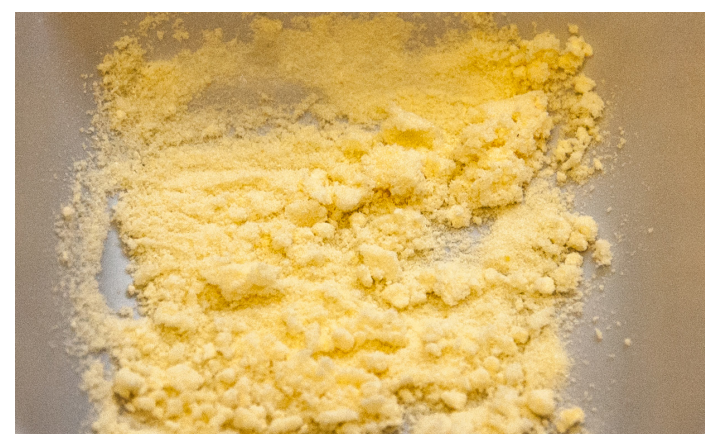
Figure 2.2. Kefir culture.