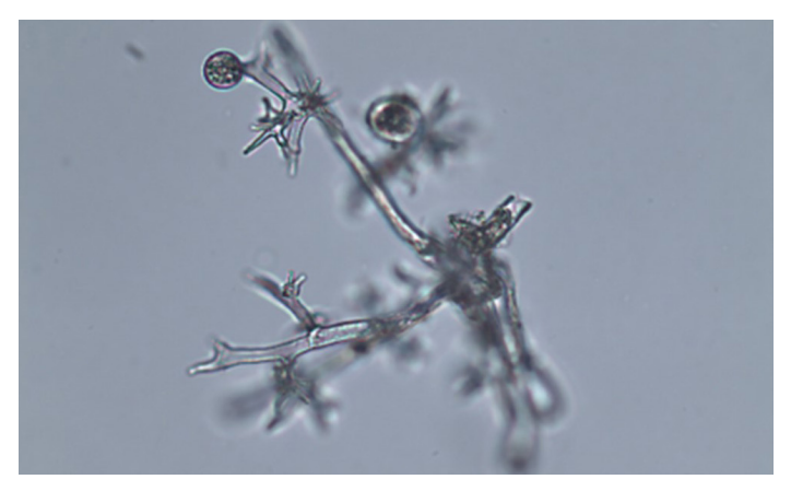
Figure 4. Conidia on branched conidiophores produced on wedelia, typical of downy mildew, as viewed under a compound scope.

x 180-400 \mu m), highly branched (Fig. 1), white initially, and emerge from stomata on the leaf surface. Its conidia are ovoid to ellipsoid, 14-25 x 20-40 \mu m, and thin walled with a papilla (a nipple-shaped protrusion) at the distal end and short protruding pedicel on the other end. Initially the conidia are white in color, but they may darken as they age.