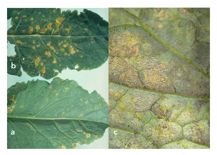
Figure 6. Downy mildew infection on the (a) lower leaf surface and (b) upper leaf surface of cabbage; (c) close-up of white fungal growth on lower leaf surface.