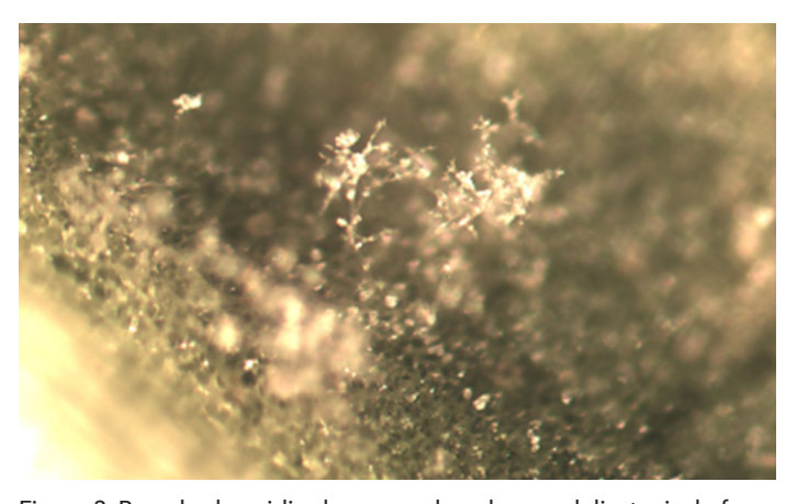
Figure 3. Branched conidiophores produced on wedelia, typical of downy mildew, as viewed under a dissecting scope