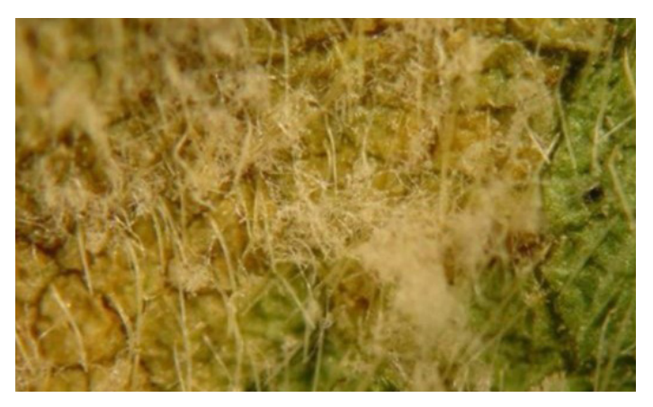
Figure 2. Example of conidiophore masses caused by downy mildew

In the Index of Plant Diseases in Guam, Corynespora was listed on 41 different hosts, all of which exhibited foliar symptoms. Of these, it is most severe on cucumber, papaya, and tomato. Other hosts on Guam include banana, guava, melon, pumpkin, edible soybean, pepper, and common weeds such as beggarticks, morning glory, browne's blechum, and siam weed. In the Diseases of Cultivated Crops in Pacific Island Countries it was listed on papaya and cucumber.