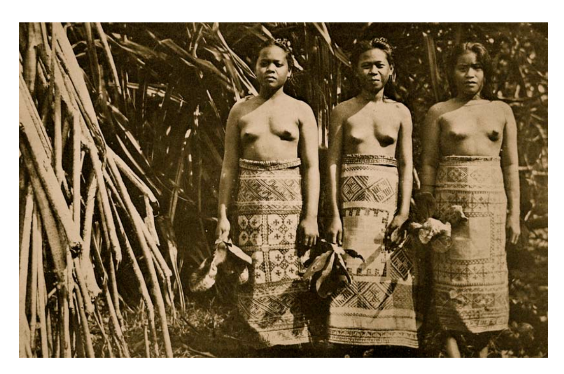
Figure 6. Marshallese "Kanaka" Women

Aside from the intensely racist overtones of this song, the romanticization of a "Nanyō" Islander woman, specifically a "chieftain's daughter," spawned a whole tropical wanderlust of male-centered romanticism and eroticism. As I have written elsewhere (see Dvorak 2007, 2008), this constituted a simultaneous ridiculing and idealization of the presumably darker-skinned "Kanaka" female body,<sup>5</sup> and it also focused the colonial male gaze onto the Marshall Islands itself. We see echoes of an almost Gauguin-esque romantic imaginary, for example, in the photographs of Japanese ethnographers in the Marshalls, such as this one, which depicts young "Kanaka" women in their indigenous attire.