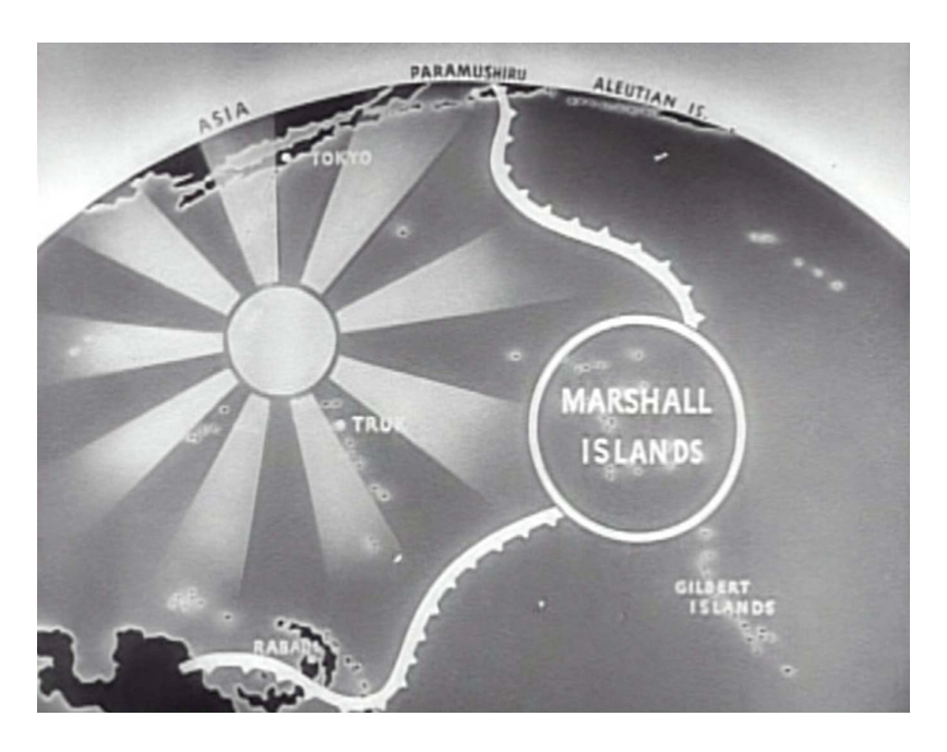
Figure 8. American Illustration of the Marshall Islands as "Center-gate" from the Film What Makes a Battle?

The Japanese layer of Kwajalein's reef is one that has literally been overwritten, bulldozed, or concreted over by a hegemonic American history of "liberation," a narrative reproduced throughout Micronesia that casts Islanders as innocent bystanders and Japanese as little but vicious aggressors. Kwajalein was one of the main bases in Nanyō Guntō by 1943, labeled "Centergate in Japan's Pacific Fortress" by one American propaganda film, which depicted the rays of the rising sun reaching out like tentacles to all corners of the Pacific, with the Marshall Islands as its point of entry.