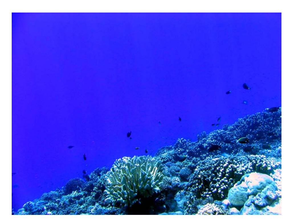
Figure 7. The Coral of Kwajalein Atoll, Near Oceanside Drop-off by Gea Pass