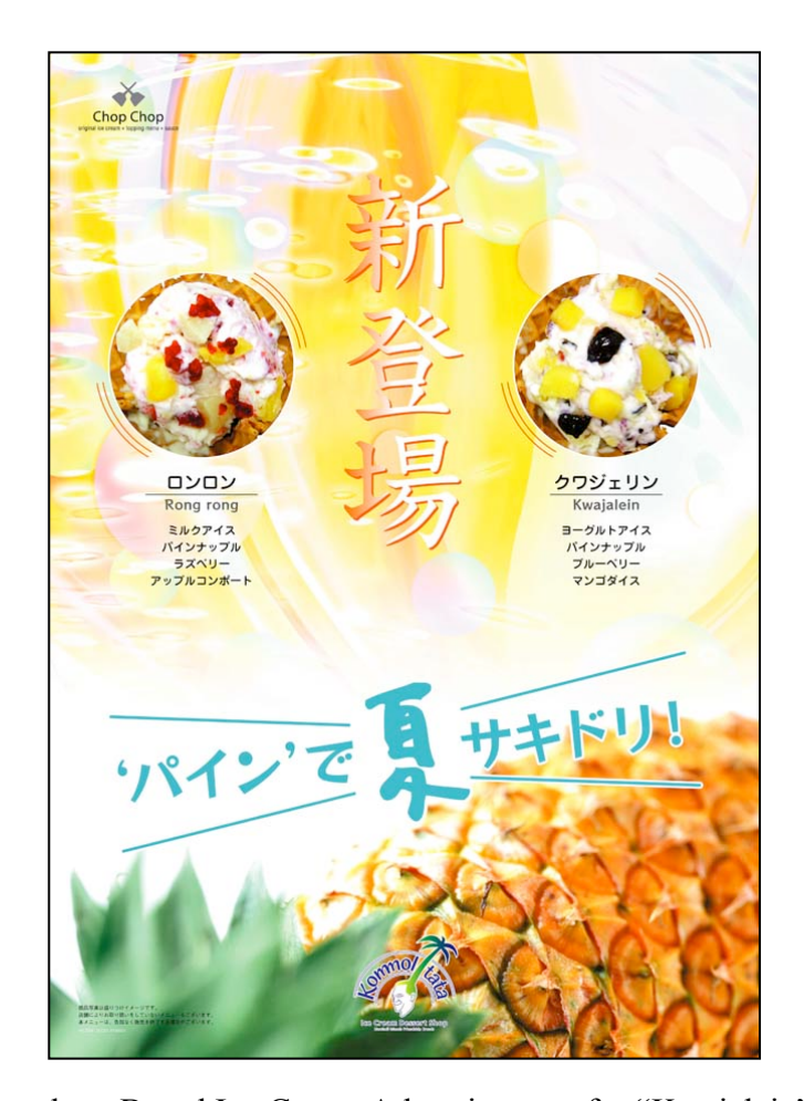
Figure 5. Kommoltata Brand Ice Cream Advertisement for "Kwajalein" Sundae, 2007 (Source: Kommoltata, Inc.)

Nowadays, contemporary representations of the Marshall Islands in Japan tend to be entirely disassociated with the prewar or wartime past. In 2007, Japan Airlines began a charter service to the capital of Majuro Atoll in the Marshalls, which advertised the islands along familiar tropes of a tropical paradise for divers, not unlike other Micronesian destinations which are also portrayed as "minami no rakuen" (southern paradise).