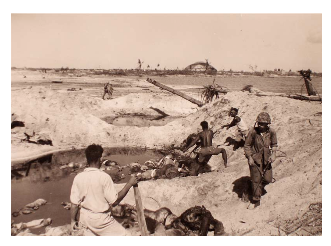
Figure 10. Marshallese Men Bury Japanese Bodies, Namur Island, Kwajalein Atoll 1944

It was not until the 1950s that the families of war dead first learned where their loved ones had died. Naval operations had been kept secret, and sailors were not allowed to reveal their location in letters home. Only after much pressure to the Japanese government did these families learn the name Kwajalein, or Kuezerin in Japanese. Gathering year after year on the 6th of February at Yasukuni, these families began to organize themselves into what eventually became the Marshalls War Bereaved Families Association, or Māsharu Hōmen Izokukai, and they represented the families of all 35,000 Japanese military personnel and civilians (such as gunzoku contractors who worked in construction, engineering, communications, etc.) who lost their lives not only at Kwajalein but throughout that whole defense campaign in the Marshall and Gilbert Islands (Kiribati).