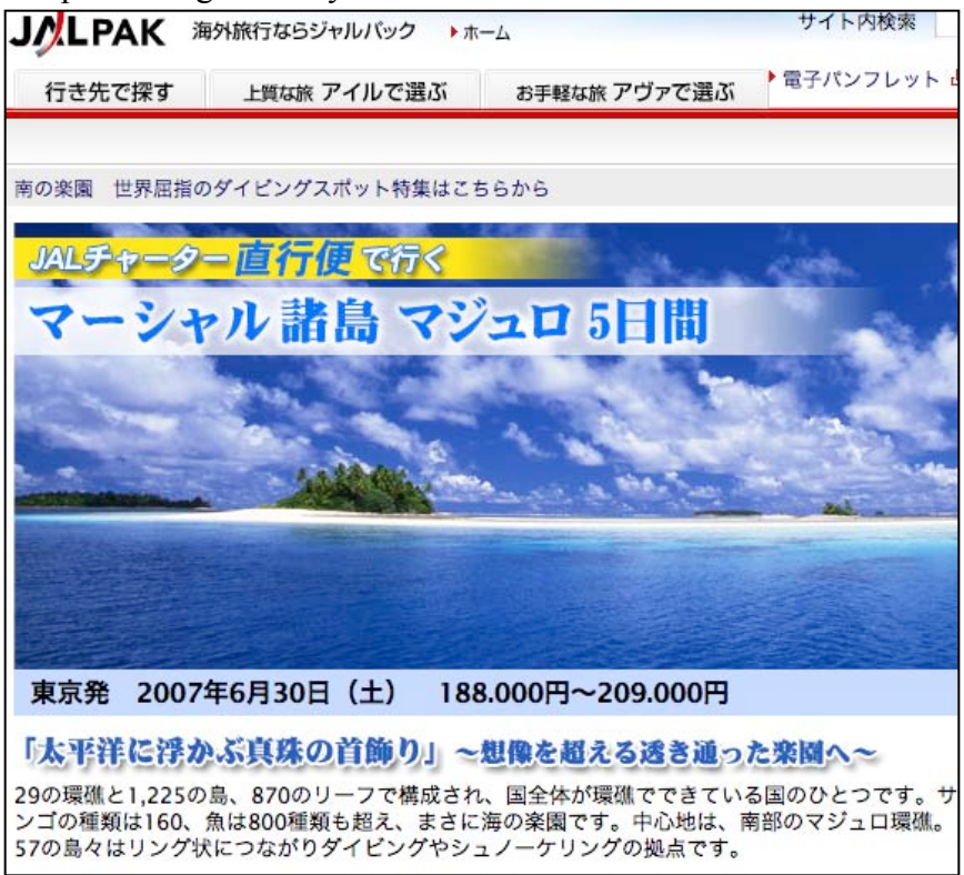
Figure 4. Japan Airlines Advertisement for Charter Flights to Majuro Atoll, Capital of the Marshall Islands