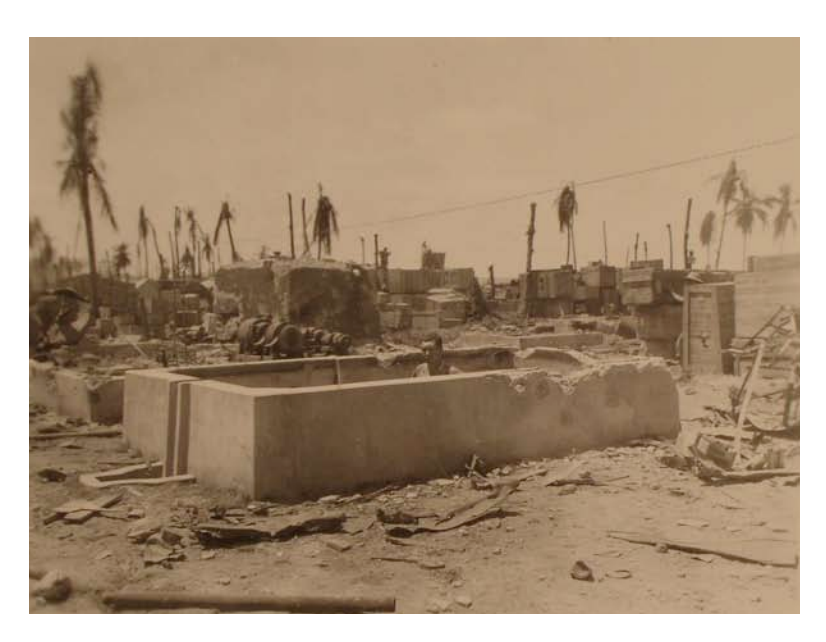
Figure 9. Communal Ofuro Bathing Area Left Standing after the Bombardment of Kwajalein Islet, 1944

The bombardment of Kwajalein Atoll lasted over several days and was to American forces a classic "textbook" amphibious landing that involved an entire 46,670 troops. When the bombardment of Kwajalein in February 1944 was complete, only 332 Americans versus 8,410 so-called "Japanese" had been killed (Walker, Bernstein, and Lang 2004). But the invading Americans could not distinguish between Japanese and Koreans, let alone many mixed-race Marshallese, thus this figure included all three groups. According to some accounts, throughout the atoll, there were only about 300 survivors—130 Japanese and 167 Korean POWs (Rottman 2005).