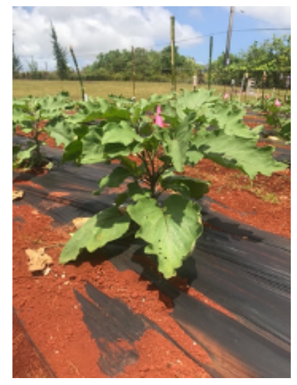
Fig. 3. Eggplant cultivar 'Ideal' growing in the northern soil.

Leaves have a large green blade with purple midrib and petioles and a wavy lobed margin. The leaf range from 18-30 cm in length, and from 12-20 cm in width. Leaf arrangement is alternate, borne singly at each node. The stem is green with purple streaks and grows upright.