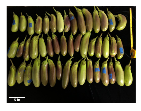
Fig. 6. Fruits of open-pollinated eggplant 'Ideal' at different stages of development.

One fruit can weigh an average of 136-250 g (0.3-0.5 lbs.). Harvestable fruit length can vary between 15-23 cm (6-9 in) with fruit width ranging between 5-8 cm (2-3 in).