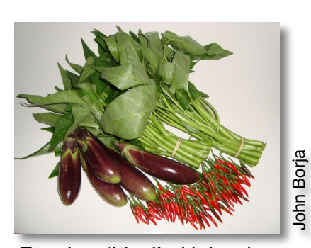
Eggplant 'Ideal' with local hot peppers and Kangkong.