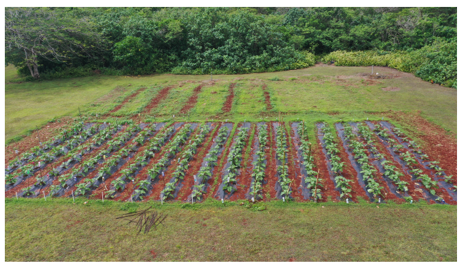
Fig. 9. Growing eggplant 'Ideal' in an isolated field. Recommended Isolation distances is 650 ft (200 m) away from other eggplant cultivar growing fields.