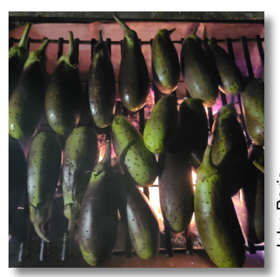
Grilling eggplant 'Ideal.'