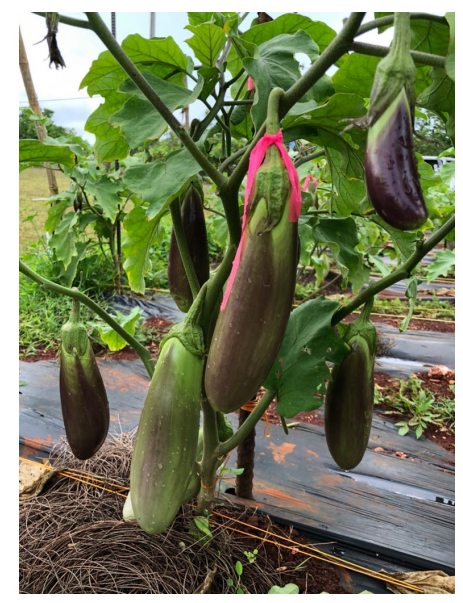
Fig. 1. Eggplant cultivar 'Ideal.'

The University of Guam and the Guam Department of Agriculture are collaborating to increase production of cv. Ideal in Guam, by increasing seed production, and distribution of seedlings to farmers and gardeners at the Guam Department of Agriculture, Agricultural Development Services, Plant Nursery.