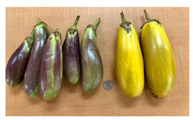
Fig. 10. <u>Left</u>: Marketable fruits for consumption; <u>Right</u>: Fully mature fruits for seed production.

When a fruit matures for seed production, the color changes to yellow and the fruit becomes bigger. Mature fruits are ready to harvest at 75-80 days after transplanting (Fig.10). It is recommended to harvest well developed fruits from healthy plants.