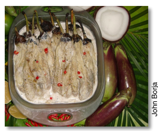
Eggplant 'Ideal' with coconut. milk.