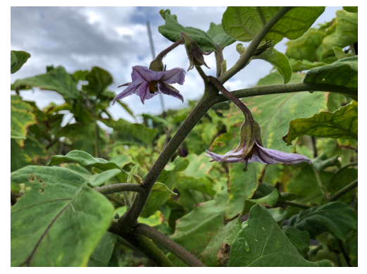
Fig. 5. Downward orientation of flowers.