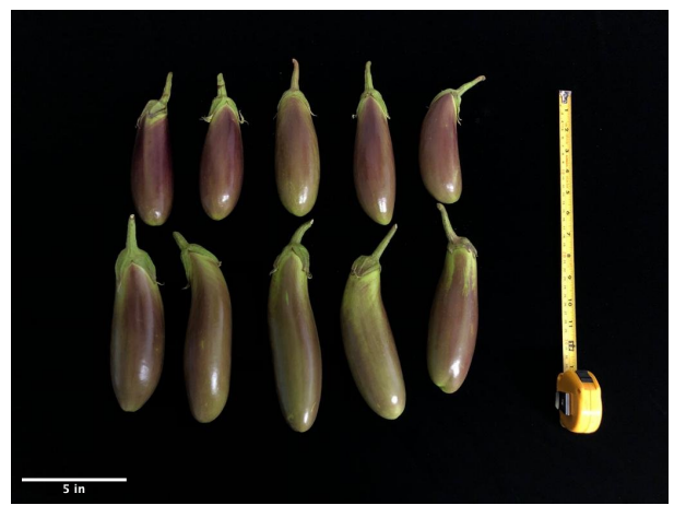
Fig. 2. Eggplant cultivar 'Ideal' fruits.