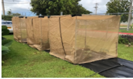
Fig. 8. Growing potted eggplant 'Ideal' plants in insect cages.