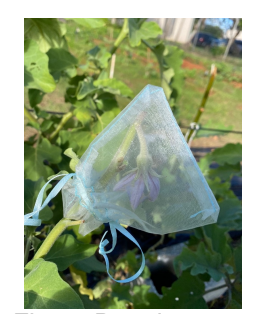
Fig. 7. Bagging a flower to ensure self-pollination.