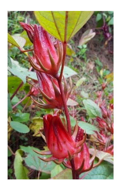
Figure 1. Red calyxes of a roselle ready to harvest.

Hibiscus sabdariffa, more commonly known as roselle or sorrel is an annual or perennial subshrub that is cultivated in tropical and subtropical regions of the world (Da Costa Rocha et al., 2014). While it is in the same genus as common ornamental hibiscus plants, Hibiscus syriacus and Hibiscus rosa-sinensis, roselle is cultivated for its mature seed pods, or calyxes (Fig. 1). Roselle leaves and calyxes can be eaten raw, but calyxes are often used for a variety of food products, including herbal drinks, jams, and food additives. In the Caribbean and Central America, the dried calyxes of roselle are boiled to make an antioxidant-rich, tart drink called Jamaican tea. Some varieties of roselle can also be used a source of fiber.