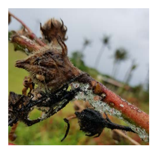
Figure 3. Severe mealybug infestation on mature calyxes.

Roselle is prone to several pests including: aphids (family Aphididae), whiteflies ( Bemisia spp.), ground bugs ( Oxy carenus spp.), and hibiscus mealybug (Maconellicoccus hirsutus) (Fig. 3) (Abdel-Moniem & Abd El-Wahab, 2006). The presence of mealybugs and aphids will also attract ants, which cultivate these sucking insects for honevdew. Registered insecticides along with regular monitoring and field sanitation can help control insect pests. Roselle is also prone to dodder ( Cuscuta spp.), a parasitic plant (Fig. 4). There is nothing known diseases of resell in Guam, however in world literature, several pathogens are reported to infect roselle plants including: root-knot nematodes (Rhyparida discopunctulata) (Morton, 1987), root rot and vascular wilt (Fusarium spp.) (Hassan et al., 2014), and bacterial leaf spot (Coniella musaiaensis) (Persad & Fortune, 1989). Dodder infestation can be controlled by gently separating dodder plants from the host plant followed by proper disposal of the parasitic plants. Soil saturation and cleaning farm tools can help control pathogens.