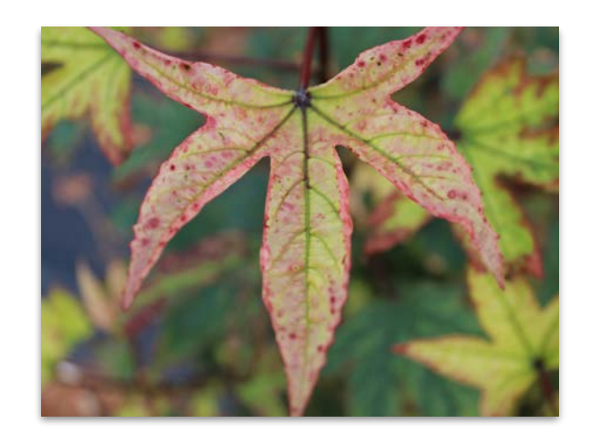
Figure 7. Inter-veinal chlorosis on roselle leaves- an indication of iron (Fe) deficiency, and purple leaf caused by phosphorus (P) deficiency.

Roselle is a specialty crop that is relatively easy to grow on Guam. Although it is not vet popular on the island, it can be used in many kinds of food products that all have potential for profit. One plant will produce more than enough calyxes for household use. Wide scale cultivation and consumer demand could potentially result in a commercial crop with minimal maintenance. When growing roselle, it is important to select varieties that are pest-resistant/tolerant and produce attractive, fleshy calyxes appealing to consumers. There are no current producers of roselle on Guam. Cultivation of roselle may be potentially profitable for interested growers.