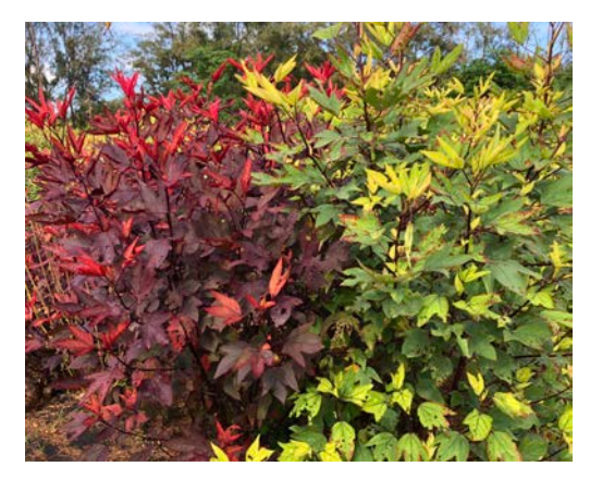
Figure 2. Two roselle varieties growing in Guam Agricultural Experiment Station Yigo Farm.

Roselle grows best in tropical and subtropical areas with rainfall of 72 inches during the growing season (July to December). This makes Guam an ideal place to grow roselle (Fig. 2).