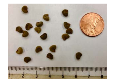
Figure 8. Seeds of Hibiscus sabdariffa

https://npgsweb.ars-grin.gov/gringlobal/taxonomydetail.aspx?id=19078