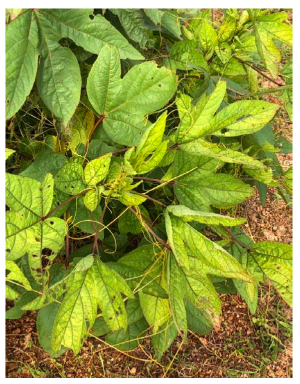
Figure 4. Infestation by dodder (Cuscuta spp.), a parasitic plant, girdling stems of a plant.