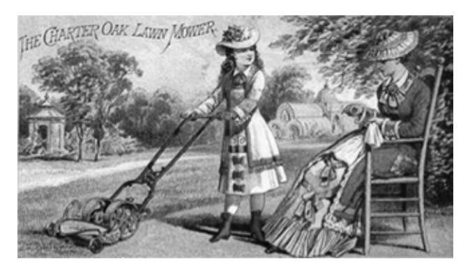
Early mower used around 1900.

Sound mowing is perhaps the single most important factor contributing to the attractiveness and longevity of any turfgrass area. Cutting leaves off at a uniform height produces smooth turf with an attractive appearance. Cutting through stems (stolons, rhizomes, and tillers) causes the turf-grass plants to generate more stems, which grow roots of their own to produce more individual plants, and therefore maintains or increases turf density. Before modern times grass was mowed by grazing animals, mostly sheep, which provided a rather rough quality of cut. Today, modern mowers provide a high-quality cut and can be adjusted with great precision, often to within 1/32 inch of the desired mowing height.