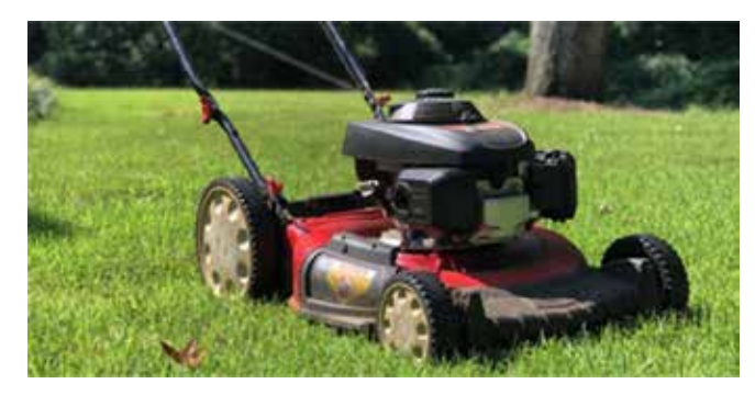
Figure 2. The blade of a rotary mower spins in a horizontal plane, striking and severing vertically growing leaf blades.

cially when the blade is not quite sharp. In general, rotary mowers are designed to mow grass taller than 1 inch, so their operation is restricted to medium- and low-quality turfs, and their primary users are home-owners. Rotary mowers, usually powered by small engines, can cut a wide variety of grasses, require little maintenance, and need only periodical sharpening (Figure 2). The spinning blade creates air movement under the mower housing that may blow clippings to the side, into a bag, or back into the turf. In recent years, the last-type, called mulching mowers, have become very popular and recommended on Guam.